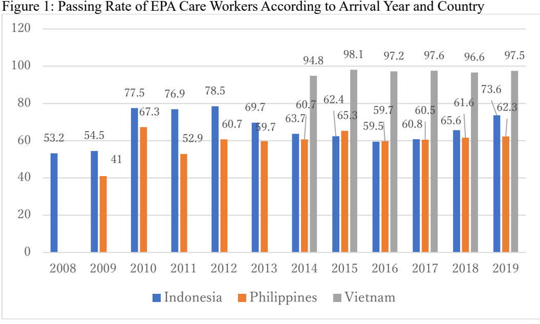
Figure 1: Passing Rate of EPA Care Workers According to Arrival Year and Country