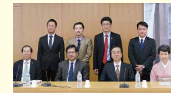
Hosting a workshop attended by the President of the Laos National Economic Research Institute (NIER) (former Prime Minister of Laos) and others (August 2019)

The University of Tokyo, Kobe University, Institute of Economic Research (Hitotsubashi University), Tokyo University of Foreign Studies, Kanda University of International Studies