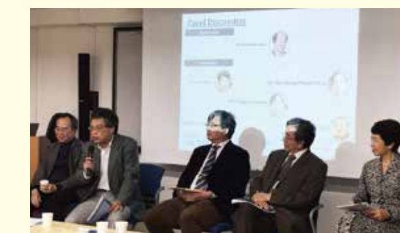
A workshop co-hosted with the Taiwan-Asia Exchange Foundation (TAEF; November 2019)