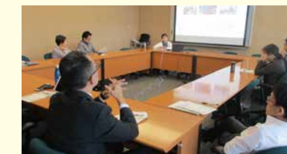
VRF Seminar (October 2019)