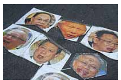
Photos laid on the ground at a UDD rally. Top, center is Prem Tinsulanonda, President of the Privy Council

The stance of the Red Shirts is simple - "dissolve the Parliament" (hold an election) – which strikes a contrast with the PAD's "politics by good people" rallying cry. To the Red Shirts, determining the country's leaders is the right of each citizen, and the only way to achieve this vision is through an election. In other words, the UDD calls for power to be returned to the people.