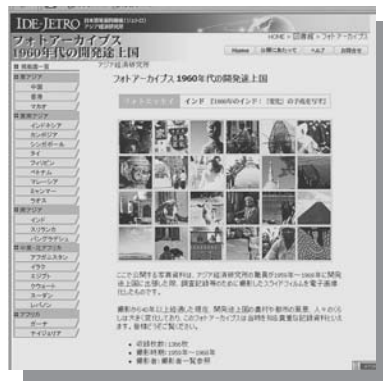
(5) Photo Archives: Developing Countries in 1960s (with legends in Japanese)