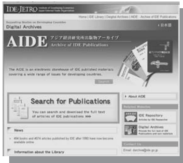
(1) AIDE – Archive of IDE Publications ( incl. publications in English)