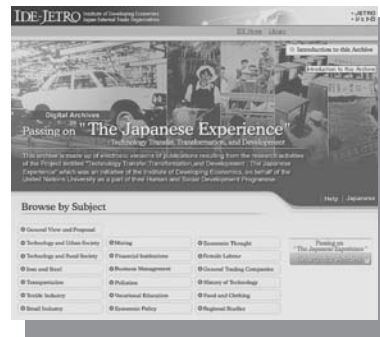
(2) Passing on TheJapanese Experience-Technology Transfer, Transformation, and Development (incl. papers in English)