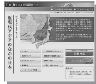
(4) Japan in Modern Asia (Japanese)