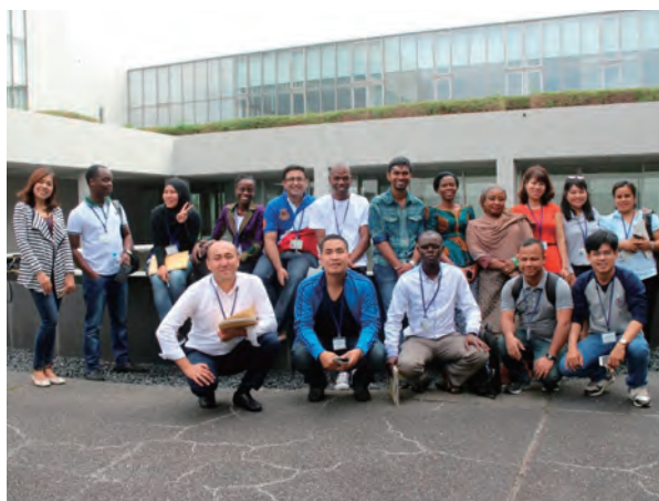
Joint Orientation (Sept., 2016)