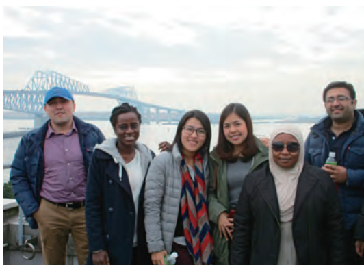
Ecology Study Tour (Koto, Tokyo, Dec., 2016)