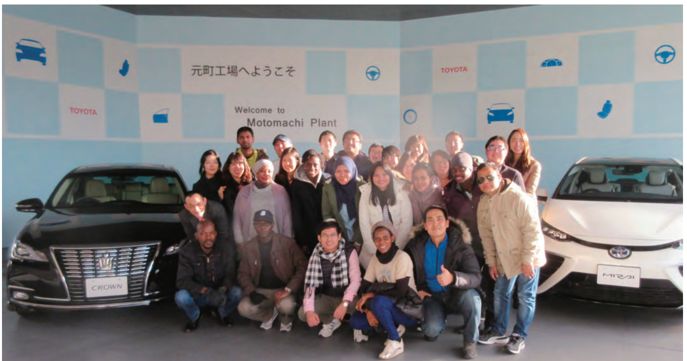
Study Tour to Nagoya (2016.12.26-27)