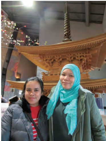
Agriculture Study Tour (Ogawa, Saitama Pref., Feb., 2017)