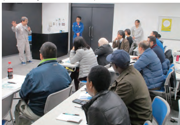
Ecology Study Tour (Ota, Tokyo, Dec., 2016)