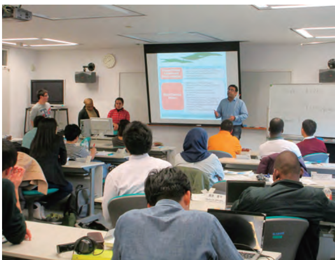
Group Presentation (Dec., 2016)