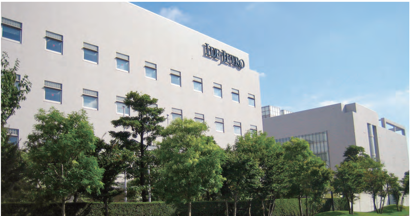
Institute of Developing Economies(IDE), JETRO