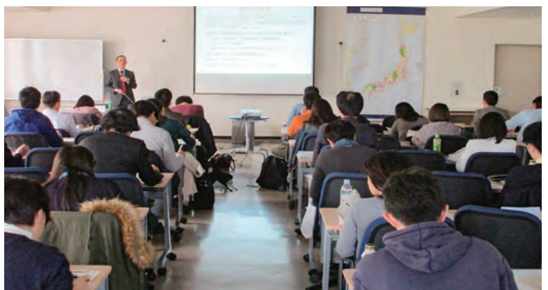
IDEAS Academic Seminar in 2016 (JICA Tokyo, April., 2016)