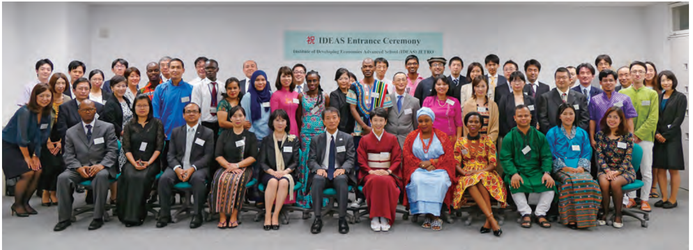
Entrance Ceremony (October, 2016)