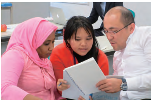
Group Discussion (Dec., 2016)