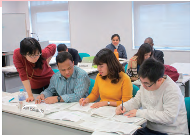
Intensive Lecture (Dec., 2016)