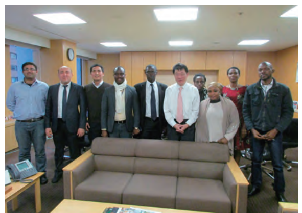
JETRO HQ Visit (Dec., 2016)