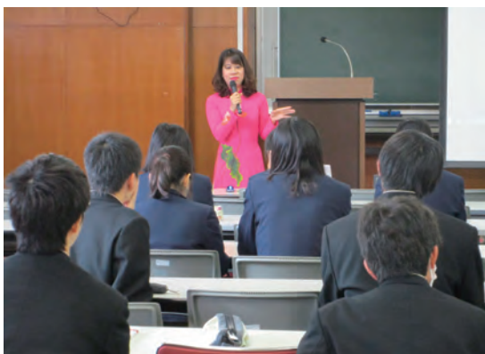
Togane High School (Nov., 2016)