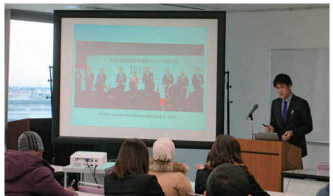
Study Tour to Nagoya (Dec., 2016)