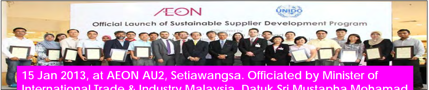
15 Jan 2013, at AEON AU2, Setiawangsa. Officiated by Minister of International Trade & Industry Malaysia, Datuk Sri Mustapha Mohamad